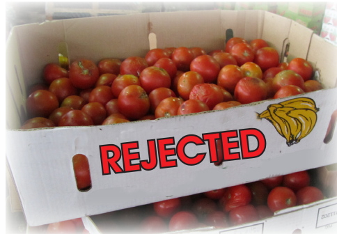
Misleading impression: Tomatoes packed inside a banana box

No wording, illustration or other device of expression which constitutes a misrepresentation or which directly, or by implication, can create a misleading impression of the content, shall appear on a container containing fresh vegetables or on a label affixed thereto or which is displayed therewith.